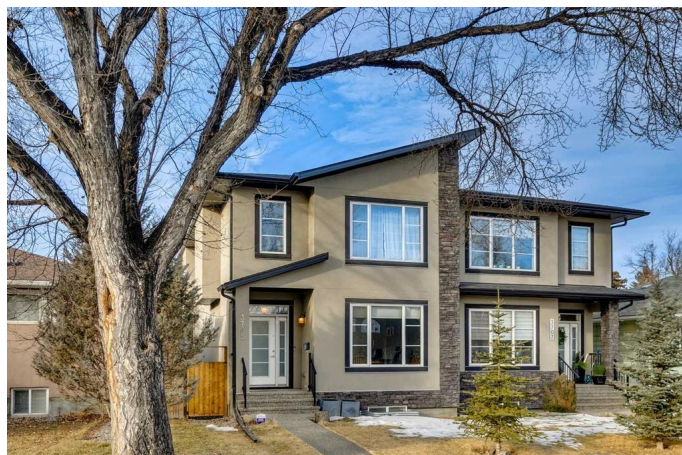
3705 2 St Nw, Calgary, AB

Upstairs, the primary suite is a true retreat, offering a generous walk-in closet and a 5-piece ensuite with a soaker tub, dual vanities, and a glass-enclosed shower. Two additional spacious bedrooms, both with walk-in closets, share a 4-piece bathroom, while a convenient top-floor laundry room adds to the home's practicality.