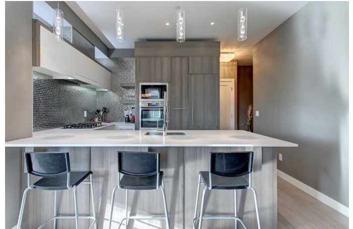
308-119 19 St NW, Calgary, AB

Welcome to Savoy by Truman Homes, where urban convenience meets contemporary style! Nestled in the heart of Kensington West, this vibrant community offers an incredible lifestyle—step outside to explore charming boutique shops, restaurants, bistros, and delis. Enjoy easy access to transit, the Bow River pathways, Kensington Village, and downtown, plus a well-established neighborhood with schools, parks, playgrounds, and more! This bright and unique corner unit boasts south east-facing exposures, flooding your space with natural light. Step into a welcoming entryway with a closet, leading you to a sleek, modern kitchen featuring high-end appliances, quartz countertops, and custom cabinets. The open layout flows effortlessly into the dining and living areas, the perfect spot to relax, with access to the south-facing balcony. The spacious primary bedroom features a luxury ensuite pampering you with a deep soaker tub, a large standing shower, and a stunning Kohler glass vessel sink. The flexible second bedroom is thoughtfully placed on the other side of the unit for added privacy. The spa-inspired main bathroom includes a huge walk-in shower and stylish glass vessel sink. Plus, the in-suite laundry offers additional storage and organization. Enjoy the added perks of a rooftop patio, secure titled underground parking, a separate storage locker, and bicycle storage. This stunning home is move-in ready—come experience the best of Kensington living today!