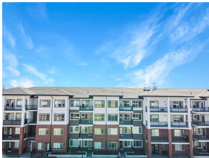
6-3212 Merganser Dr W, Chestermere, AB

Lockwood residents also enjoy exclusive access to a fully equipped fitness centre, an